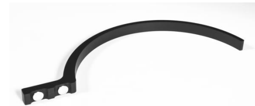
Document Return Guide with magnets

Attached to the back wall of the scanner, the four magnetic document return guides send the scanned document back over the top of the scanner to make feeding the next document a more ergonomic process for the operator. The guides are adjustable for optimal placement based on the width of the batch of documents being scanned, further increasing production speed.